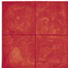
FM 300 Cut Stone