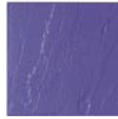
18 x 18 Yorkstone