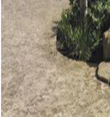
Rough Stone Texture