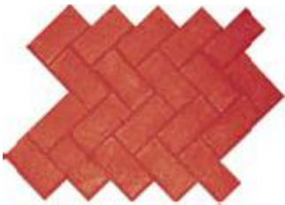
FM 5050 Herringbone NewBrick