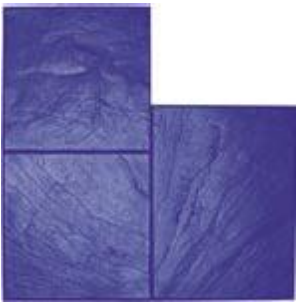
FM 3120 Ashlar Cut Slate