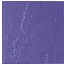
24 x 24 Yorkstone