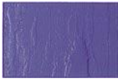
18 x 30 Yorkstone