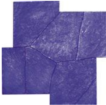
TM 1300 Castle Stone