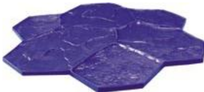
TM 200 Random Stone