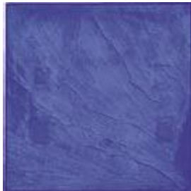
FM 3200 24x24 Slate