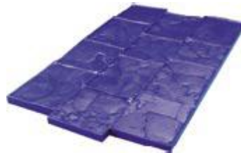
FM 540 London Cobble