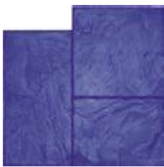
FM 3150 Large Ashlar Cut