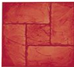
FM 3500 California Weave 24x24