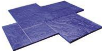
FM 3650 Regal Ashlar