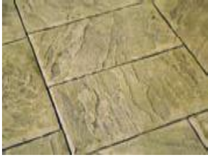
FM 3175 Yorkstone