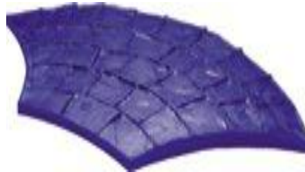
FM 650 European Fan