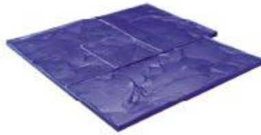
FM 3125 Ashlar Cut Slate