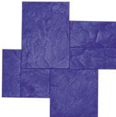
FM 3675 Grand Ashlar