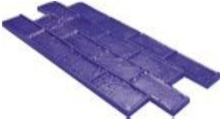
FM 5150 Running Bond New Brick