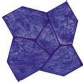
TM 700 Flagstone