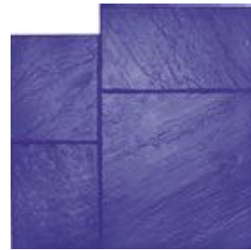
TM 100 Ashlar