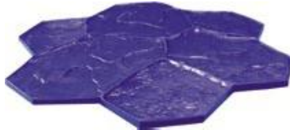
FM- 700 Random Stone